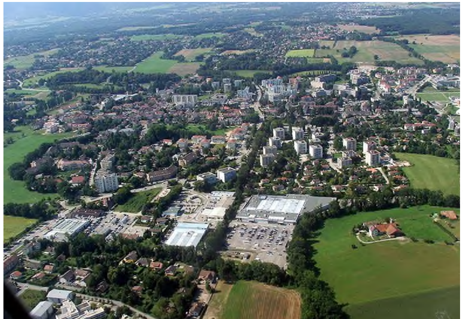
Ferney-Voltaire, near Geneva, is home to Crossroads Church.

Attending an international church challenges its members to re-examine which Christian traditions are more ethno-cultural than biblical and to put aside personal preferences and