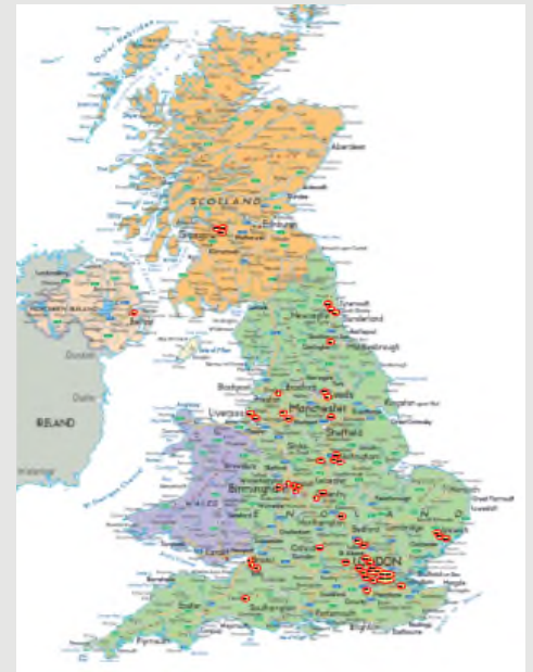
In the last 15 years, some 80 Romanian churches have been established in the UK (shown in red).

Emmaus Church, Birmingham, is at the centre of a growing network of Romanian churches in the UK. It was initially planted in collaboration with the Baptist Union of Romania and today works with George Road Baptist Church, Birmingham, the Heart of England Baptist Association and a number of other partners. 5 Emmaus describes itself as a "kingdom minded church... making disciples and planting new churches mainly focusing on East Europeans." This mission mindset has led to an emerging network of churches as part of a vision for planting 12 churches