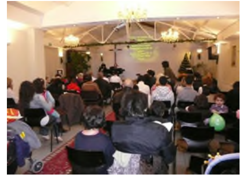
The Arabic-speaking Protestant Church in Brussels

This model stands for ethnic churches that use ethnic languages. It works better if the selected ethnic group is big enough. Such ethnic churches may remove the feeling that Christianity is western and irrelevant, or that it may damage the ethnics’ identity. Ethnic churches show the Christian faith as an applied dynamic for “life change,” and may have a more direct impact on the community. Ethnic churches in Europe serve as living examples of expressing ethnic converts’ new life in Christ without any fear of losing identity or feeling unbalanced due to major unnecessary changes. Through this model, Christian faith can be better translated into cultural forms, emotional factors can be adequately recognized, and the new converts can feel the side of Christianity where their emotional needs are met in a more family type atmosphere. Ethnic converts could be better trained and