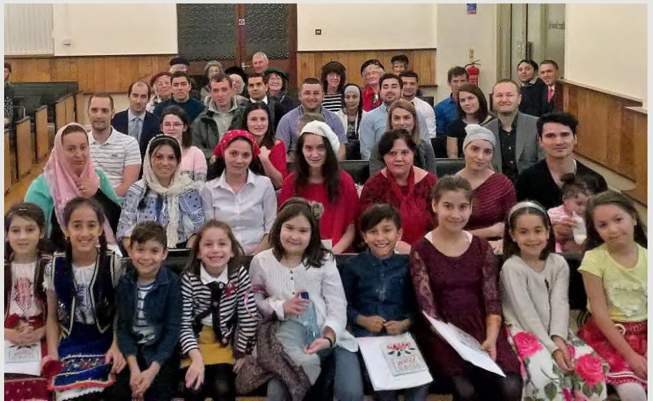
Romanians worshipping at Larne Gospel Hall in Northern Ireland

The church is an independent local church, overseen by three elders, one of whom has been learning Romanian and has been able to preach some short messages in Romanian. As well as attending Sunday services, the Romanian members of the congregation meet on a Friday afternoon to have fellowship together in limba română . The elders encourage the Romanian members to maintain their identity but without splitting from the rest of the church; they work hard at promoting unity within the